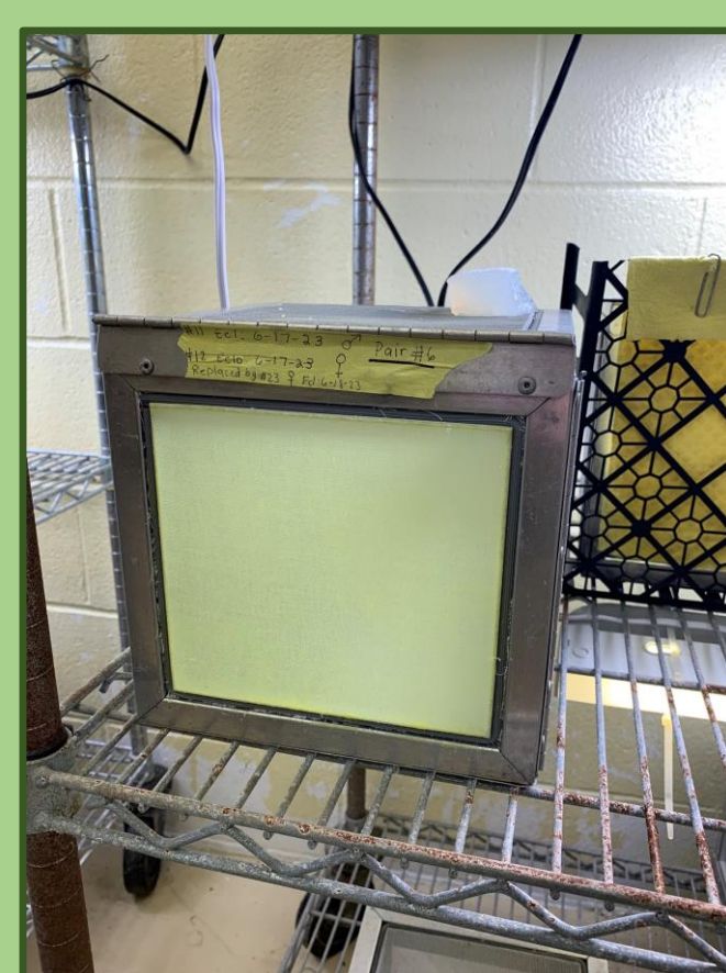
Fig. 2 Yellow wax panel