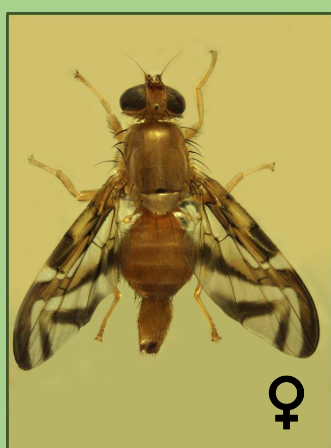
Fig. 1 A. suspensa (Loew)

Wild A. suspensa larvae were reared from Surinam cherries, Eugenia uniflora , harvested from the SHRS USDA-ARS Station in Miami, FL. When the flies reached the adult stages, eleven mating pairs were placed into 6" x 6" x 6" cages to individually monitor oviposition rates. One side of the screened cage was replaced with a cheesecloth panel coated with yellow paraffin wax and a green paraffin wax dome was placed inside the cage. Domes were made by covering a tea filter (ranging from 1" to 2.5" in diameter) with a cheesecloth and coating it in green wax. A water-soaked cotton wick was set under the dome and black filter paper was set under the dome to catch any eggs that fell off the dome. For the wax paneled side of the cage, a wet sponge was propped against the cage to maintain moisture. The green dome resembles a guava fruit, Psidium guajava , as previous research has suggested that wild A. suspensa prefer to oviposit on a domed structure rather than a flat surface. 1 The inclusion of the yellow wax panel was based on current colony rearing protocol, where LR A. suspensa accept the panel as an acceptable oviposition substrate.