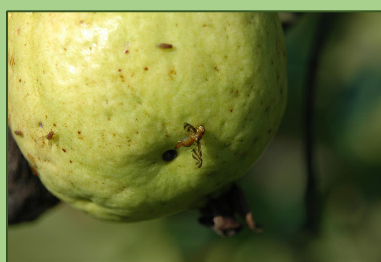
Fig. 4 Wild female on a guava fruit