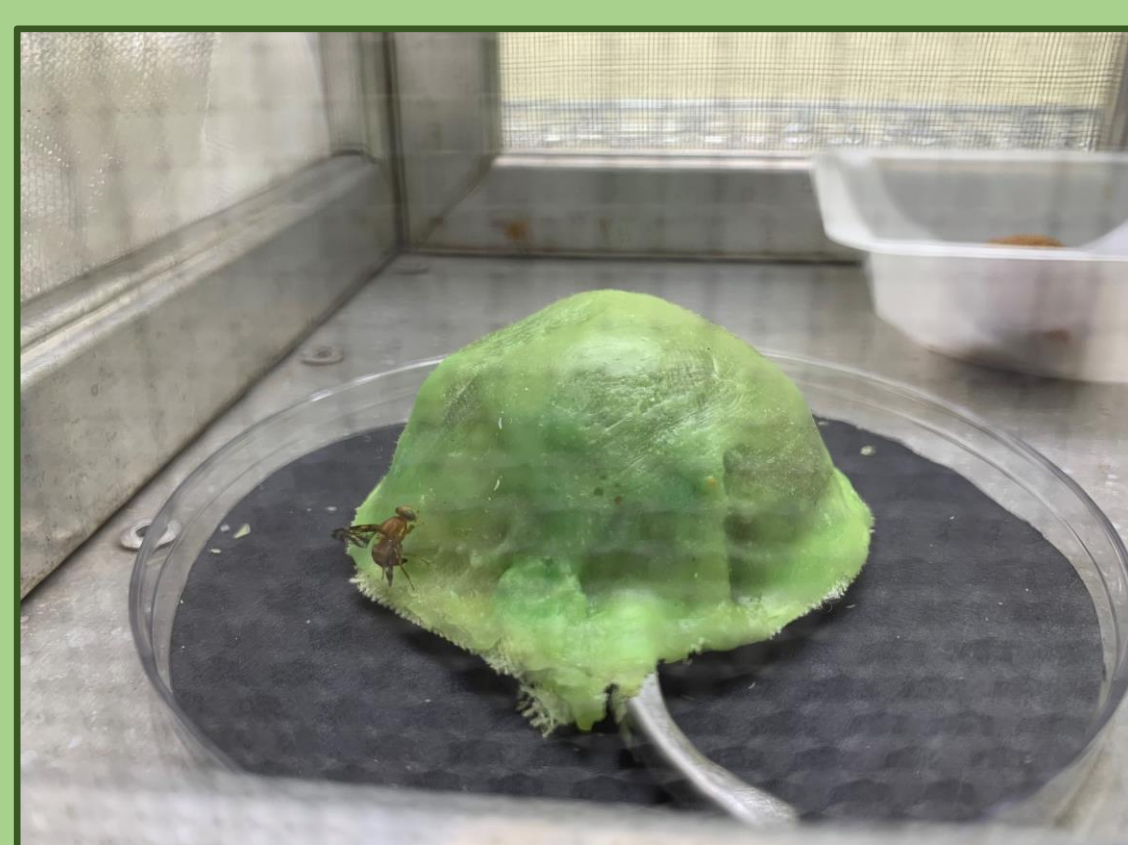
Fig. 3 Wild female ovipositing onto a dome

Cages were checked daily for the number of eggs laid, with the location and quantity of eggs being recorded. The eggs were collected using a synthetic hair brush, placed into petri dishes filled with artificial larvae diet, and checked daily for signs of hatching. Eggs were continually collected until the female died.